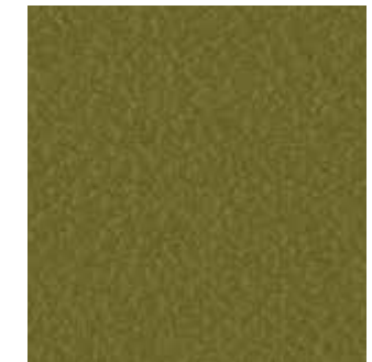
20241 Brown green