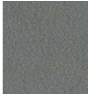
07432 Mouse grey