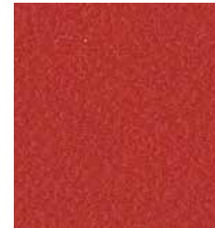
07478 Cinnabar red