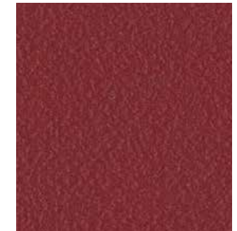
07479 Carmin red